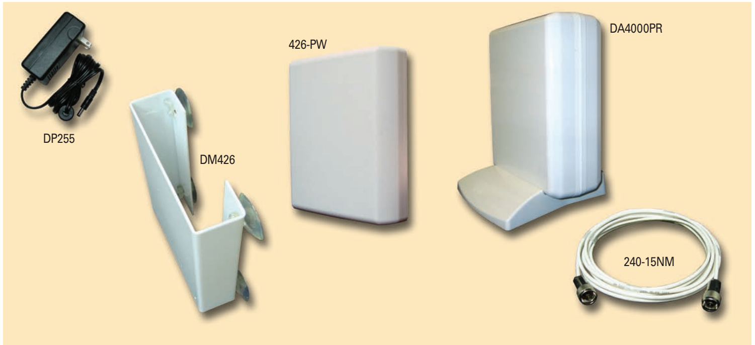
Complete System 4KPR-15R

CONDOS | APARTMENTS | DORM ROOMS HOMES | OFFICES